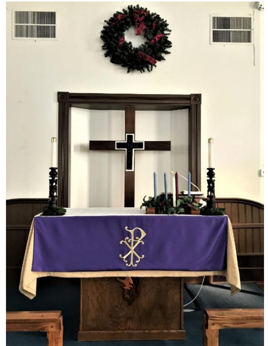
The Altar with the Advent Wreath