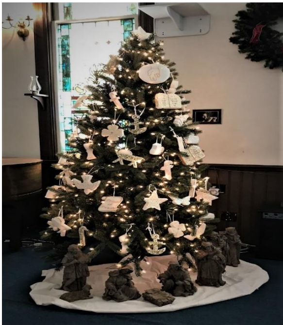
The tree with the Nativity